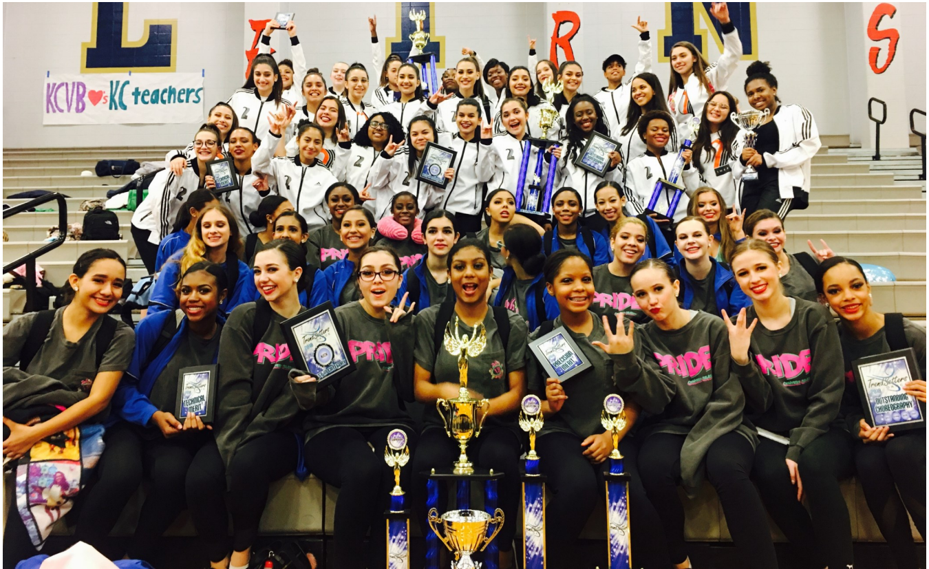
Inertia 2, upper level in white, and Pride, lower level in royal and grey, compete at Trendsetters Regional

Inertia 2 kicked off their competition season at the Trendsetters Regional competition at Klein Collins High School over the weekend. With very limited time in preparation, Inertia 2 was able to walk away with the following awards: Super Sweepstakes award (an average of 90 or higher in 3 routines), Technical, Precision, and Choreography Merit awards, Best in Class Hip Hop routine of the day, Award of Excellence (one of the highest averaged scoring teams of the day) and Best in Class JV team.